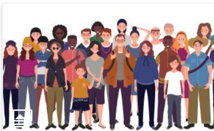
Prophetic Teachings about Our Bodies