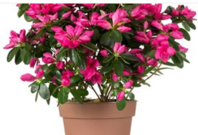
Room to Grow